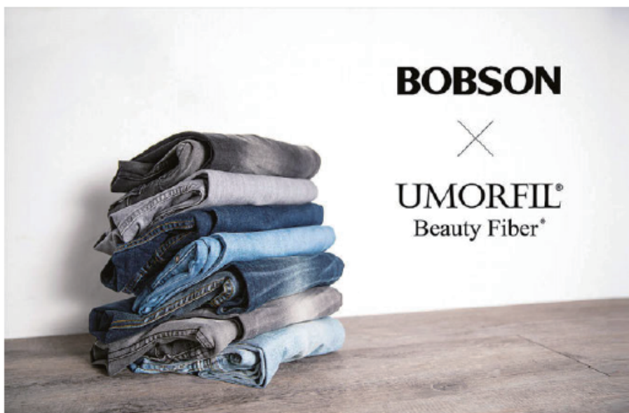
Denim from Bobson Jeans' spring/summer 2017 collection featuring UMORFIL.

"Because UMORFIL is made from protein amino acid it can perform better than regular viscose and cellulose fibres in terms of moisture regain. UMORFIL can provide 16–18% moisture regain, and