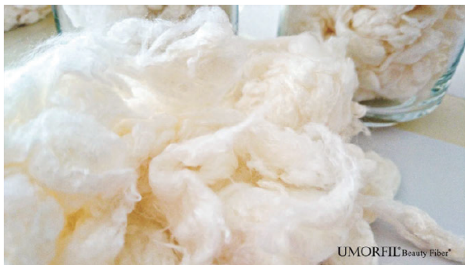
UMORFIL Beauty Fiber.

for comfortable denim that can be worn every day as part of an active lifestyle. The collection, initially for womenswear, was expanded to include menswear from 2014.